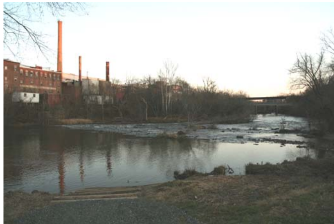
The Granite Mill complex dominates views from the HRT in the Town of Haw River