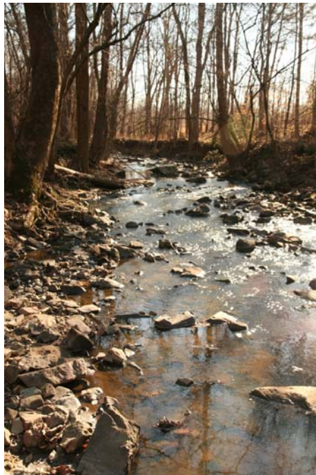
Perennial Stream on the Gerringer Mill Property

T he Haw River Trail Partnership finalized the acquisition of 191 acres on the Haw River in February. The property, located off Gerringer Mill Road north of Burlington, will extend the Haw River Trail/Mountains-to-Sea Trail by over a mile.