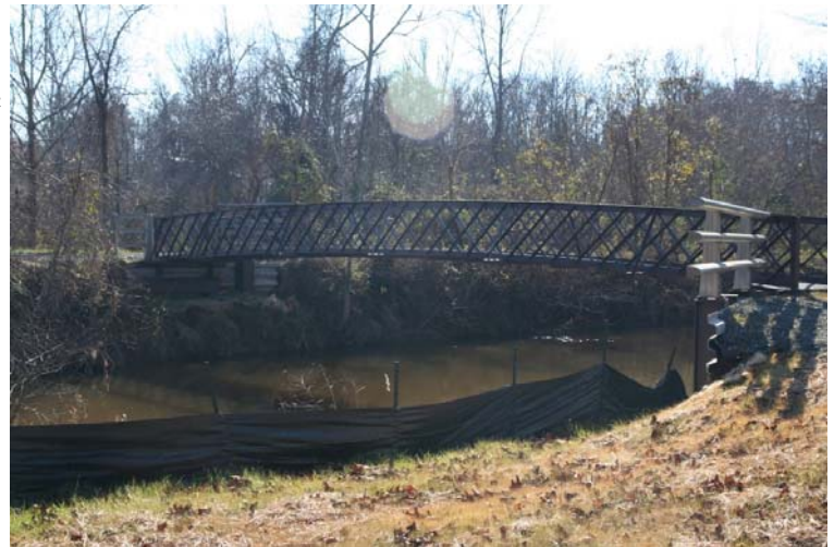
“New” Bridge at Altamahaw Paddle Access. The bridge was removed from Burlington’s NorthPark, renovated and placed by NCDOT.

Finally, trail construction is progressing on the newest section of Haw River Trail/ Mountains-to-Sea Trail between Glencoe Paddle Access and Carolina Mill. For much of the one-mile distance of the new trail segment, the trail traces the route of the old mill race to historic Carolina Mill. The challenging topography of the site requires the construction of at least 15 bridges, boardwalks and steps before opening to the public. The trail is being developed by Burlington Recreation and Parks.