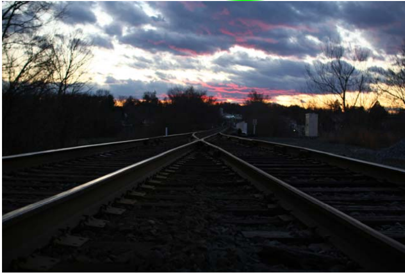
Railroad Bridge over the Haw River—Adjacent to Red Slide