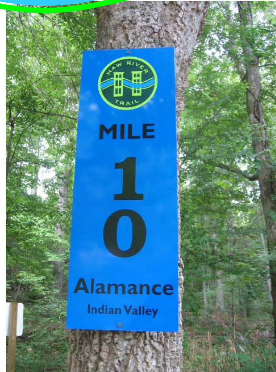
New Mile Marker Sign at Indian Valley Paddle Access

The first of 37 mile marker signs have been going up on the banks of the Haw. The signs are being placed every mile along the River and include the name of the each community the Paddle Trail passes through. The signs are an effort on the part of the Haw River Trail Partnership to improve safety on the River and to enhance the experience of paddlers on the Haw River Paddle Trail. In the event of an emergency on the River, the mile markers will help paddlers identify their location on the river and help emergency responders locate paddlers in need of assistance. In addition, the markers are being integrated into a series of Haw River Paddle Trail guide booklets, highlight-