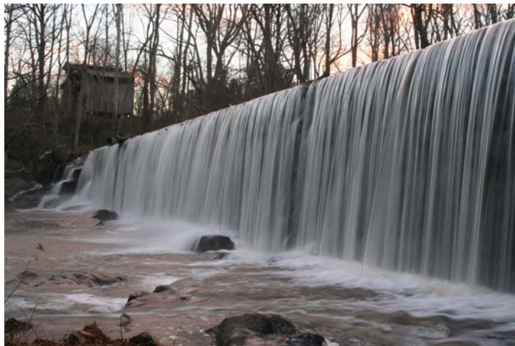
Glen Raven Dam. Alamance County's last remaining stonework dam on the Haw River.

The site of the paddle access has been used by paddlers and fisherman for years with the informal permission of Glen Raven, Inc. The new agreement with ACRPD will allow for improvements and regular maintenance on the property. The agreement will also create safe portage around Glen Raven Dam, the only remaining stonework dam in Alamance County. The ACRPD is currently making improvements to the site including constructing a parking area, installing steps to the river and placing a pedestrian bridge on the property. The bridge is being renovated and moved to the property after being removed from its former home in Burlington's NorthPark. Haw River Trail Partner Burlington Parks and Recreation Department donated the bridge, and the renovation and setting of the bridge will be done by the North Carolina Department of Transportation.