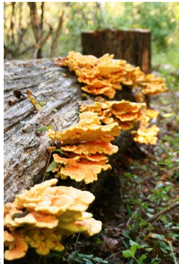
Bracket Fungus at future site of Greensboro-Chapel Hill Road Paddle Access.

2008 marks the second consecutive year the HRT Partnership has received an RTP grant. The 2007 grant is being used to construct the 15-acre Red Slide Park in the Town of Haw River. Previous RTP grants have also been used to construct Swepsonville River Park and to assist in trail development along the Haw River Trail from Indian Valley to Carolina Mill.