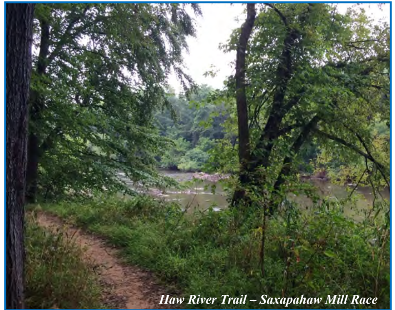
Haw River Trail – Saxapahaw Mill Race

Twenty-seven new property acquisitions have been added to the land trail route in Southern Alamance County, between Great Alamance Creek south of Swepsonville River Park and Cane Creek on the Alamance-Orange County line. This stretch of river is over ten miles long and gaining land here requires the cooperation of several landowners. We have acquired critical pieces to continue the Haw River Trail (HRT) south from Swepsonville River Park and to create nearly four miles of contiguous HRT in the heart of Saxapahaw. The existing Saxapahaw section will extend two miles downriver and one mile upriver, following the Church Road bridge and connecting to trails on Saxapahaw Island. Funding for the project came from a multi-year grant from the North Carolina Parks and Recreation Trust Fund.