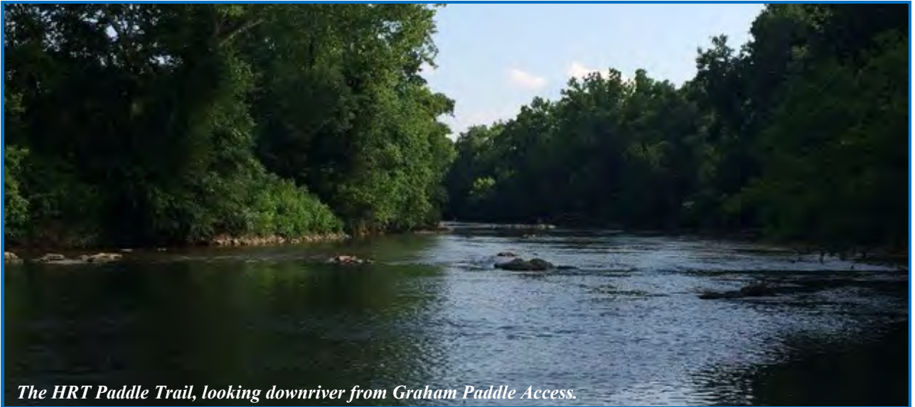
The HRT Paddle Trail, looking downriver from Graham Paddle Access.

The Haw River Paddle Trail was featured in Our State Magazine in June. The article reviews the history of the Haw River, provides a paddle guide, and details the current value of the river to wildlife, paddlers, and the regional economy. Check it out at ourstate.com/haw-river-paddle .