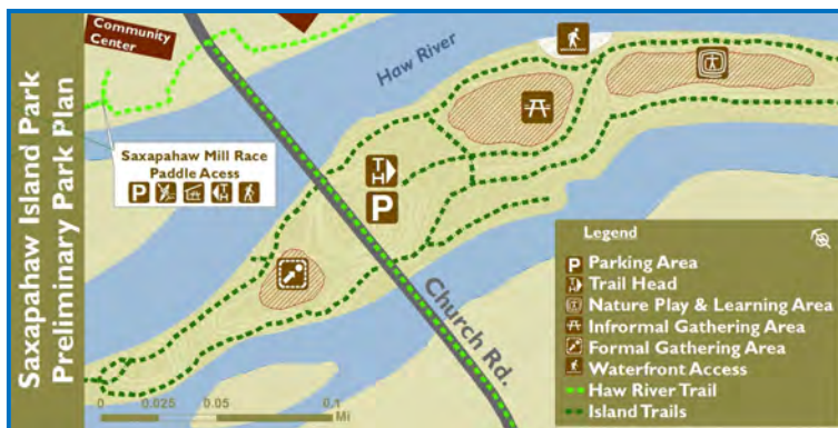
Conceptual plan for Saxapahaw Island Park.