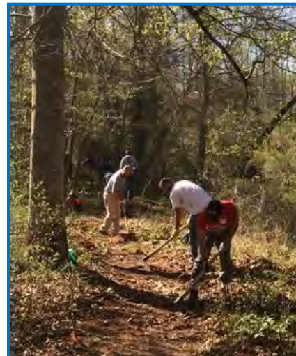
FMST volunteers designed and built a new 24-foot bridge along the route (top). They used hand tools to clear and level the trail (bottom).