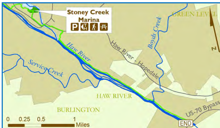
Map of the Sellers Falls section of the Haw River Trail, which connects to the Glencoe Section at Stoney Creek Marina.

The Sellers Falls Section is slated to open this winter.