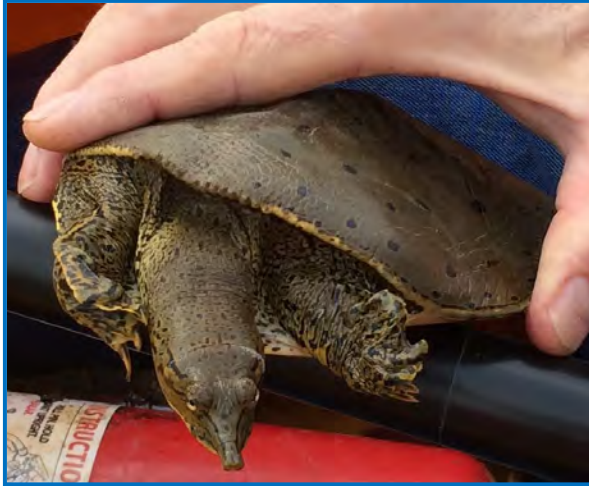
Spiny softshell turtle found basking on the rocks of the Haw River.

While paddling on the Haw River Trail, we came across an unusual turtle basking on the rocks—a spiny softshell ( Apalone spinifer ). This turtle has never before been documented from the Haw River Watershed nor from the Cape Fear River Basin (see sidebar for more about river terminology).