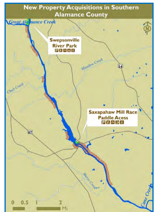
HRT land route in Southern Alamance County. Recent acquisitions shown in red.